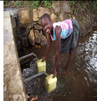
A protected spring