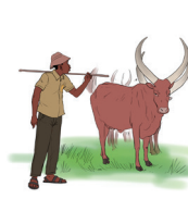
People cutting trees