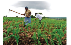
People growing crops