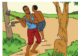
People cutting trees