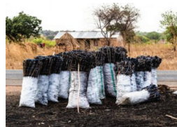
People burning charcoal