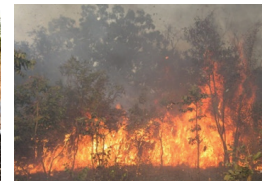
People burning bush